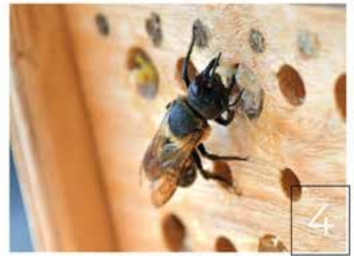
1 Leaf Cutting Bee